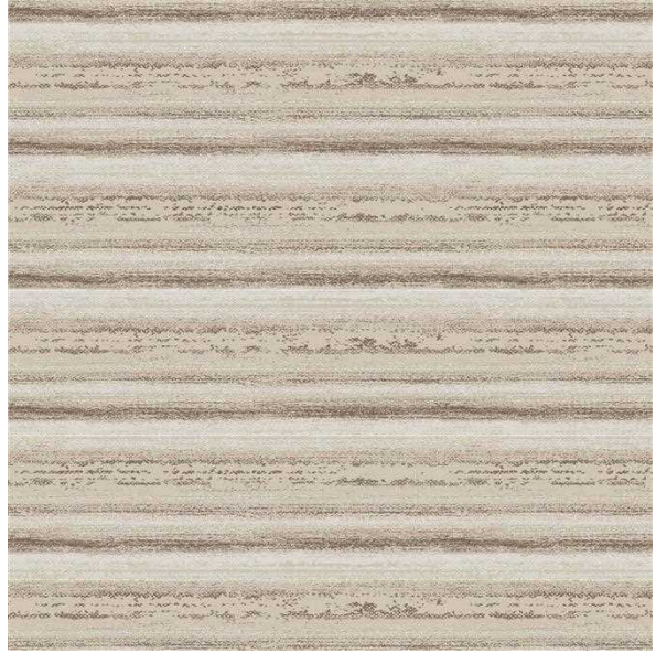
Col 02- Beige