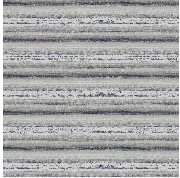
Col 06- Grey Blue