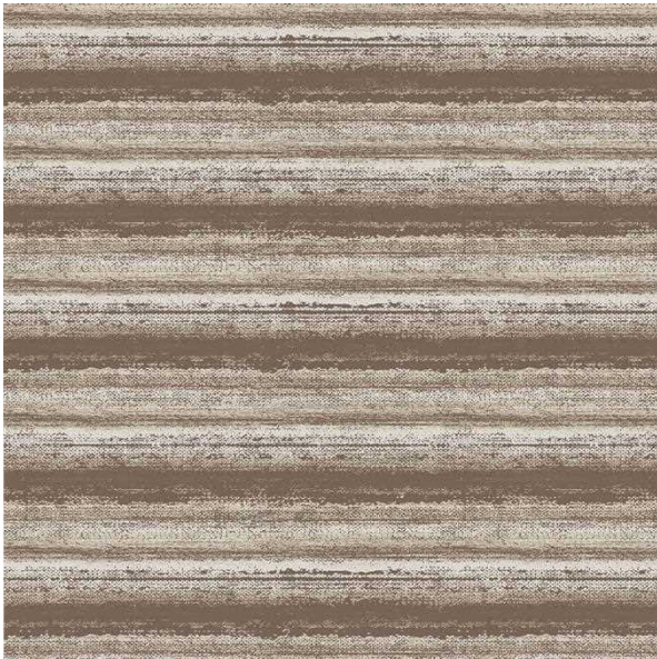
Col 03- Brown Beige