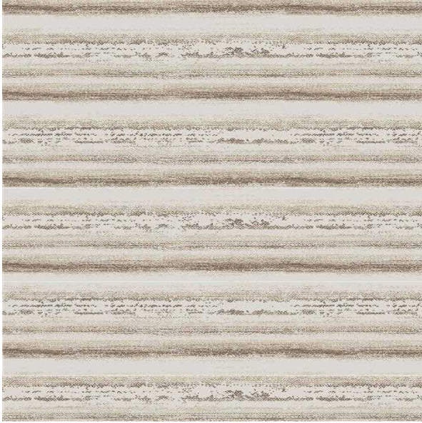
Col 01- Cream Beige